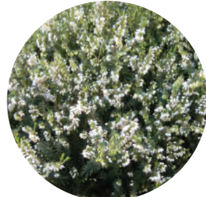
Erica carnea 'Springwood white'