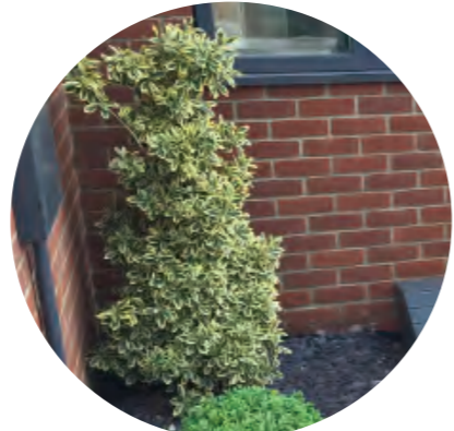
Euonymus fortunei 'Bravo'