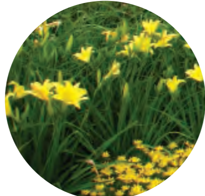
Hemerocallis 'Stella d'Oro'