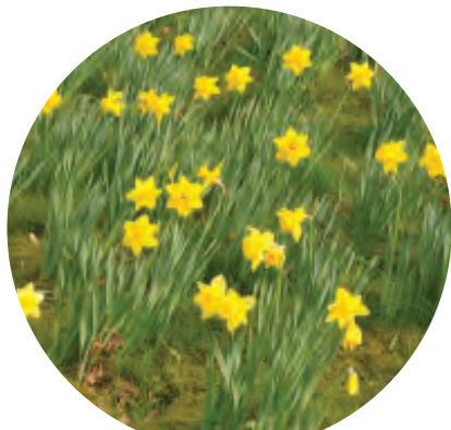
Narcissus 'February Gold'