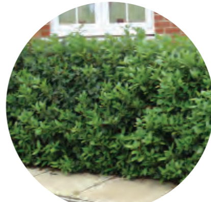
1.2m high evergreen hedge to frontage