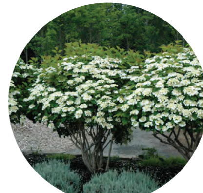
Native Buffer Viburnum opulus 'Compactum'

Specimen shrub/tree such as Taxus baccata topiary within the amenity areas adding vertical interest, add to local landscape character, seasonal interest throughout the development. Also planted near to the Owners lounge to provide architectural feature planting.