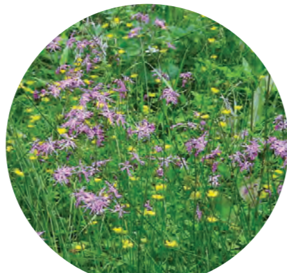
Wildflower Meadow - Shade Tolerant