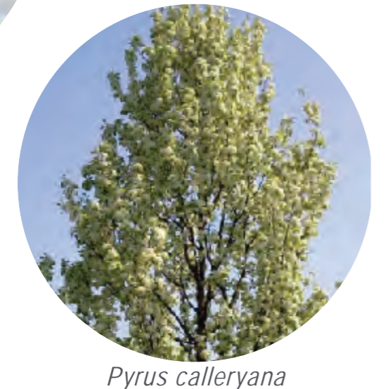
Pyrus calleryana 'Chanticleer'