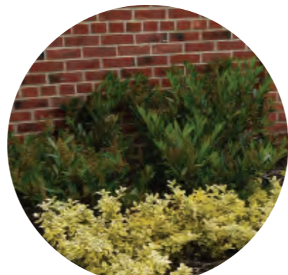
Prunus laurocerasus 'Otto Luken' & Euonymus 'Emerald 'n' Gold'