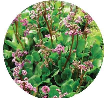
Bergenia cordifolia 'Purpurea'