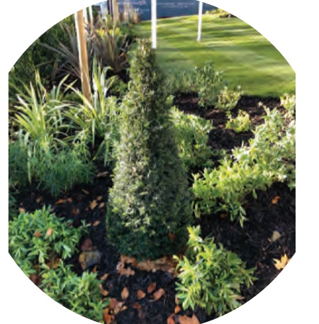
Topiary including spheres and cones - e.g. Taxus baccata or Ilex crenata

Evergreen trees will provide year round visual mitigation and support local biodiversity