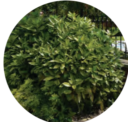
Aucuba japonica 'Variegata'