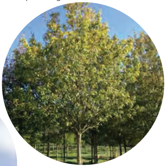
Acer campestre 'Streetwise'