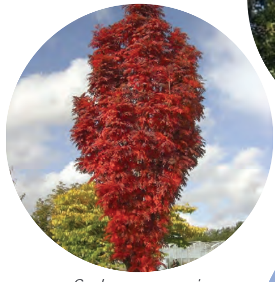
Sorbus aucuparia 'Autumn Spire'