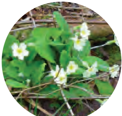
Primula vulgaris Wild primrose