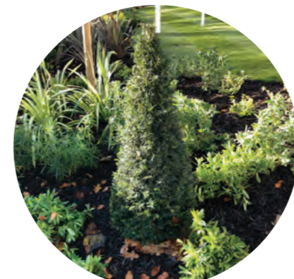
Topiary including spheres and cones - e.g. Taxus baccata or Ilex crenata