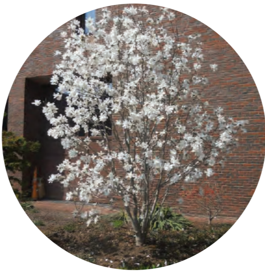
Magnolia stellata 'Royal Star'